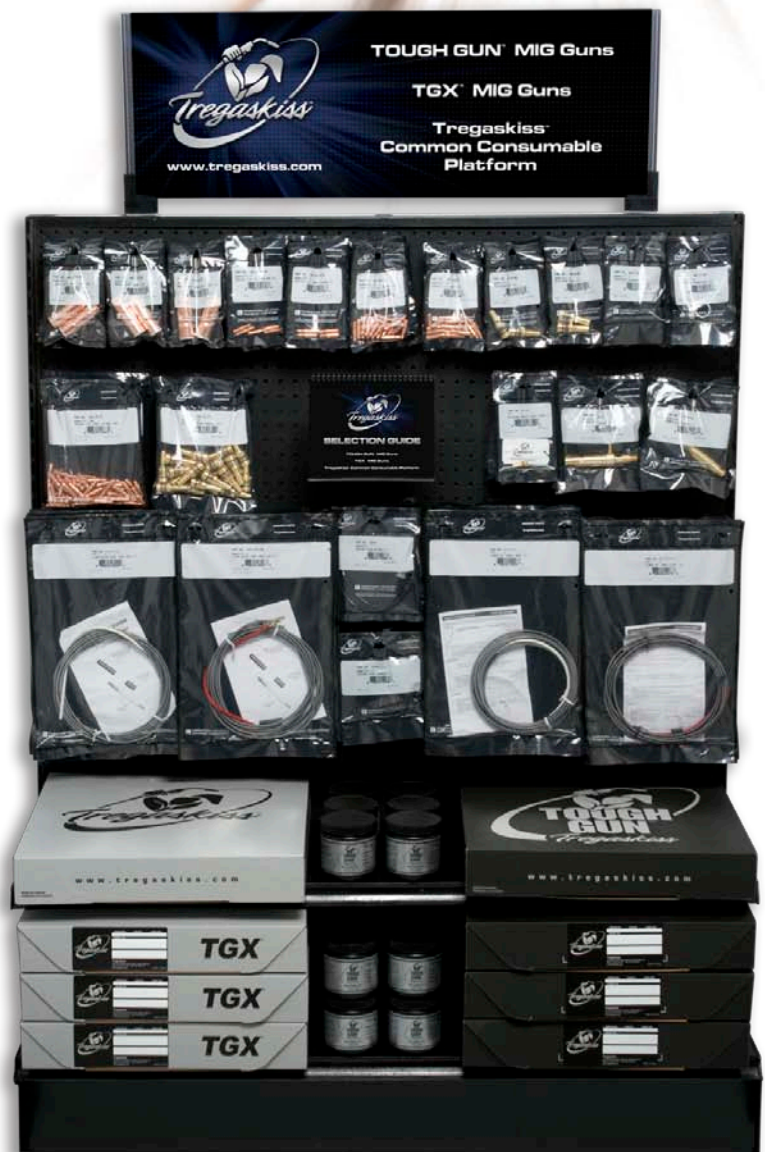
Typical Display. Shelving Unit Not Available.